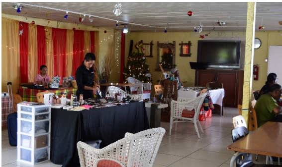
Figure 12 A scene from the library's Christmas Market

Individual decorated stands offered handcrafted goods and beautiful intricate Christmas Jewelry.