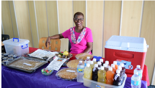
Figure 11 A Christmas Market vendor poses in front of her table display at the Christmas Market

The Library's annual Christmas Market presented crafters from all over St. Maarten displaying their arts and creativity. Shoppers could get one-of-a-kind gifts, and decorations, find new products and old favorites that can be shared as gifts.