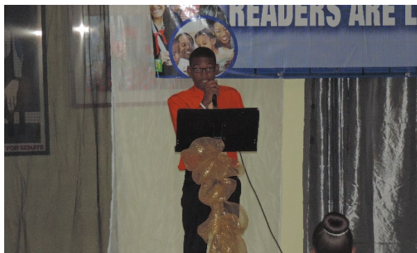
Figure 15 A youngster performing at a fun-packed Readers are Leaders event

The Readers are Leaders club hosted their 7 th annual reading competition opening ceremony for the 2016 – 2017 term on Wednesday 21 st , September 2016, from 5.30 pm to 7.30pm at the Philipsburg Jubilee Library.