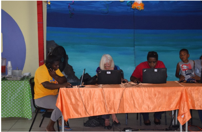
Figure 20 Participants and volunteers at the literacy screening

The SXM Reads campaign brought to the general public a literacy screening program to read and provide an opportunity to test one's reading skills. This took place from 11 am to 1pm at the library on Saturday June 11 th .