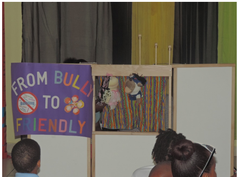
Figure 1 USM students performing a puppet show

The aspiring student teachers performed a total of 4 shows: