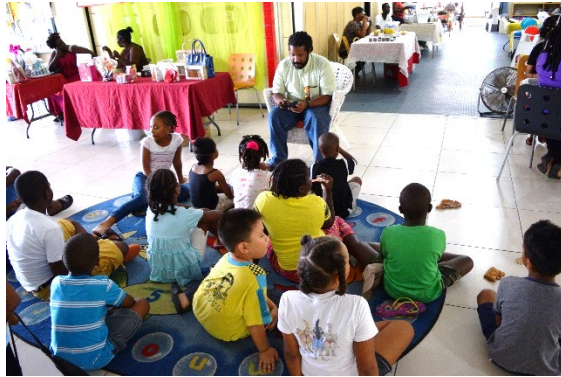
Figure 6 During the Mother's Day Market there was storytelling for children

The library hosted its first Pre- Mother's Day Market on Saturday May 7 th , 2016 from 10 am to 1pm.