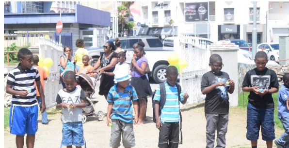
Figure 2 Children at the Easter egg hunt taking part in games

Children attending this event were engaged in fun activities, such as: face painting, 2 Puppet shows, various games and a grand Easter egg hunt, where hundreds of eggs were hidden on the Vineyard Estate grounds. There was also a golden egg for the parents to hunt. Yes, parents were also involved in this year's hunt.