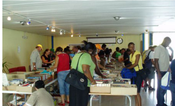
Figure 4 Visitors browsing through the books on offer at one of the library's book sales

Buyers did not need to walk with their own bags, the library offered for the first 10 persons who purchased books a free environmentally friendly book bag with the slogans "I love books" or "Get your green on at your library"; all other bags were for a small price of NAF 1.80 or $1.00.