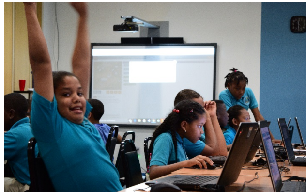
Figure 18 Schoolchildren learning and enjoying their time spent in the Media Lab

The students created a stop motion animation film using clay, toy cars and other props. The animation film highlighted the issue of road safety, and why it is important for drivers not to be distracted by phone calls and Youtube videos. All of the students were involved with the production of the animation from start to finish, which includes the storyboard, the special effects, creating of the props and the narration. The students learned that animation is a time consuming process that requires all of their undivided attention for it to be a good production.