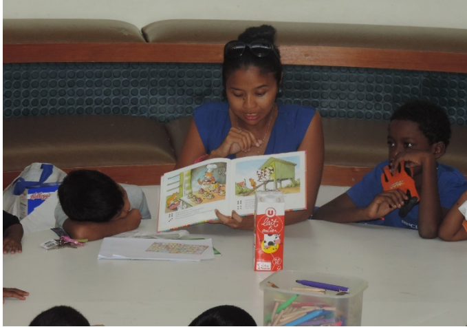
Figure 21 Each week young library goers look forward to the Story Time/ Dutch is Fun activity

Every Saturday the library hosts Story Time reading sessions for children. In 2016 the library also transformed the regular reading hour into a story time in Dutch. On Saturdays from 11 am to 12 pm, as of the 5 th of March 2016, the library's Story time has been done in Dutch and the name of the program is Dutch is Fun.