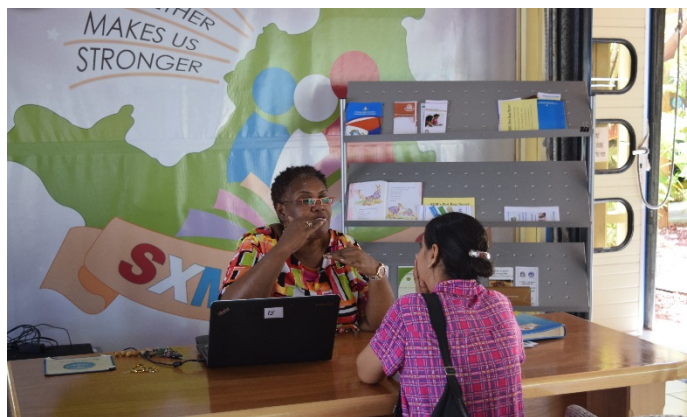
Figure 19 At the Literacy Helpdesk workers were on hand to answer questions from the general public

On Thursday, January 28 th , a brand-new helpdesk was opened at the library. This new literacy helpdesk was for persons who need assistance with literacy and language problems. The helpdesk, which is situated in the hall of the library, was aimed at helping persons who need assistance in matters such as filling out forms, understanding complex documents and other language problems. The helpdesk also gives out community information, such as how to reach health care and social workers, government services, and other social organizations and support groups.