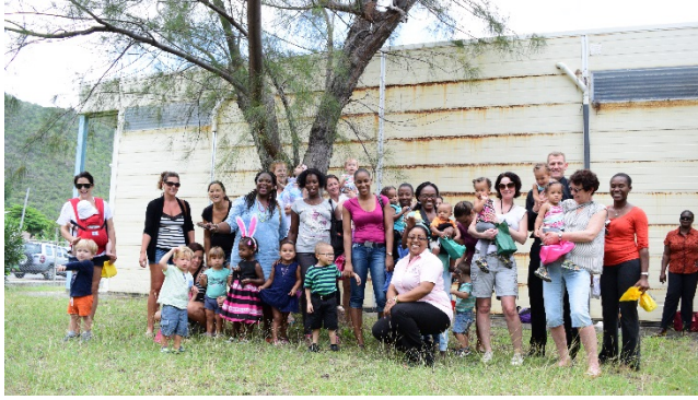
Figure 13 Participating babies and toddlers and their parents at one of the Baby and Toddler events

Throughout the year, as part of the Read to Me: Baby and Toddler activities there was storytelling and fun and games for babies and their caregivers.