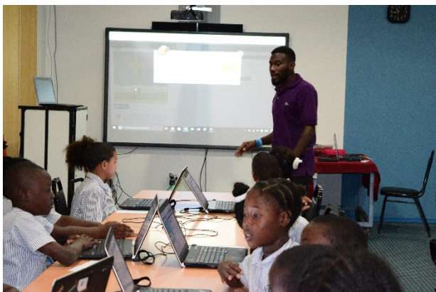
Figure 17 A library staff member providing computer classes to schoolchildren

The Foresee foundation re-launched Digiworkz on Friday April 22 nd , 2016, at the Philipsburg Jubilee library in the Media Lab. Digiworkz is a branch of the foresee foundation that aims to make learning fun for children by introducing them to technology at an early age. This is done by creating an environment that challenges young minds to become creative and innovative while learning more about math, science and engineering so they will be ready to function in the world of the 21 century.