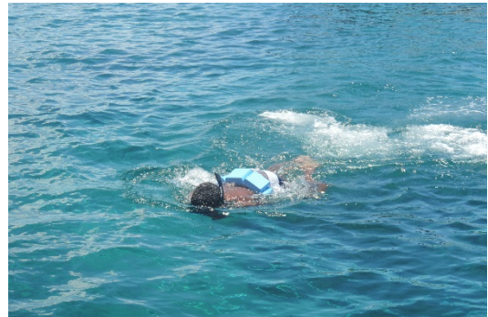
Figure 8 A camp participant taking part in activities

The summer program had activities such as poetry: spoken and the written word; a game night where all