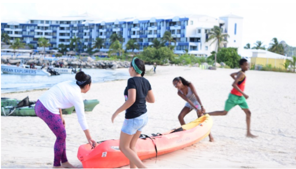
Figure 9 Teens at the summer camp enjoying activities together

were welcome to participate and bring their own games for an amicable tournament; computer classes: the making of Clay Animation & Animoto; The reading of one book and the book discussion over the entire summer vacation; movies at Caribbean Cinemas; Kayaking; exploring the fauna and flora of the Simpson Bay Lagoon; having an EPIC talk, walk and picnic to Back Bay; and last but not least a boat ride and swimming with the fish at Tiki Tiki Hut Divi Little Bay.