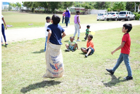
Figure 3 Children at the Easter egg hunt taking part in games

An interactive puppet show was also held by the returning group of students from the University of St. Maarten.