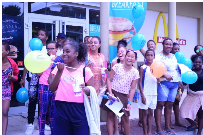
Figure 7 The children of the children's summer camp after enjoying a meal together

This year the annual Summer Program for children ages 7-12 years old took place again. It was something sensational to do last summer for a great number of children.